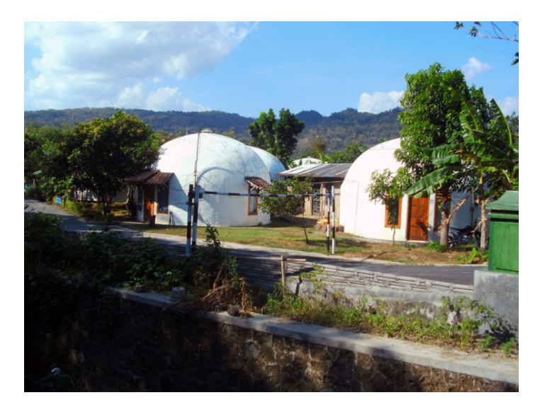
Figure 1. New Ngelepen Village with dome houses.

On May 27, 2006 a 6.3 magnitude earthquake struck Yogyakarta, Indonesia killing more than 5,000 people.<sup>1</sup> More than 100,000 homes were destroyed and another 200,000 were damaged. Hundreds of thousands of people were left homeless. Shelter was needed for the homeless people, and many countries and organizations provided assistance in the form of food, medicine, shelter and also housing. Dome for the World Foundation, a nonprofit organization from the USA donated a total of 81 new buildings for earthquake victims in Ngelepen. Ngelepen, a village in Yogyakarta, was relocated because of landslides caused by the earthquake. The basic building shape is a dome, which up until the earthquake was foreign to Indonesia.