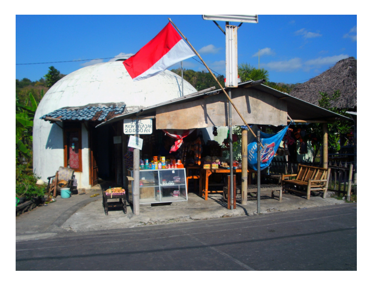
Figure 2. Additional space in front of dome house that is used for warung and terrace. Typical additions and alterations to Dome Housing.